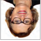
POR BRENDA KINDEHAN

Ora: Señor, ayúdanos a vivir nuestra fe a través de conocerte, amarte y servirte en este mundo para ser feliz contigo por siempre en el cielo. †