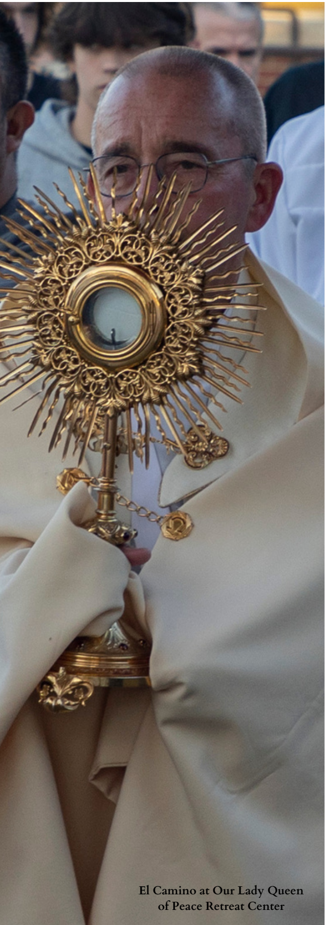
El Camino at Our Lady Queen of Peace Retreat Center